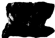
Fragment of a lead trial-piece.