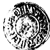
Penny for Aethelstan c. 927-39.

In 973 a later king, Eadgar, arranged that all coins should have the same design (known as the type ), wherever they were made. The most important mints were at London, Winchester, Lincoln, Chester and York; all were to strike the same type, and this would be changed at regular intervals. The obverse of each penny was to bear the king's head surrounded by his name and title; the reverse was to have the names of the moneyer and mint around the central design. This basic arrangement continued in use until well into the Middle Ages. The penny remained the only value of coin made. If smaller values were needed, the coin was cut in two for halfpennies and into four for farthings !