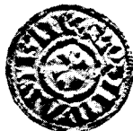
Penny for Vikings of Northumbria c. 895-905, with religious inscription: MIRABILIA FECIT.

Late in the 9thC, when the Vikings controlled York, they began to make large numbers of silver pennies. Some, like the continental coins, had short religious inscriptions on them; others gave the name of the mint where they were made: EBRACE for Eboracum , the Latin name for York.