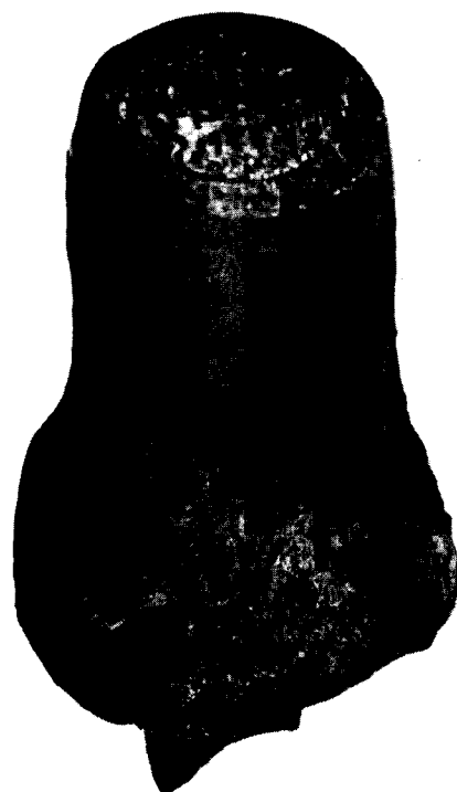
Die for St. Peter coins.