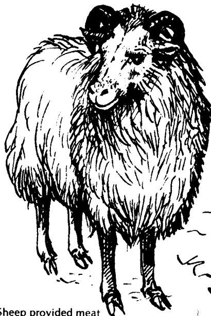
Sheep provided meat and wool ...

We can take detailed measurements of the bones which are dug up and compare them with the bones of modern animals; this gives us a good idea of size and build, but tells us nothing about their colour!