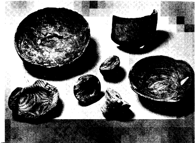
Wooden cup, bowls and waste cores found on the Coppergate excavation.

It is clear that Vikings and Englishmen must have lived side by side in Yorkshire, not only in the early years of settlement, but even after the English kings regained control of York in 954. Two-thirds of the men who are recorded in Domesday Book as having houses in York in 1065 had Scandinavian names.